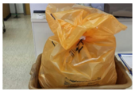
C) Autoclavable bags are filled to only 75% of their holding capacity and placed inside appropriate plastic secondary container. The bag opening should be at least 3 finger widths to allow steam to penetrate inside the bag.

A) Pyrex flasks are filled to only 75% of their holding capacity and placed inside appropriate plastic secondary container, with space between each item to allow steam to circulate.