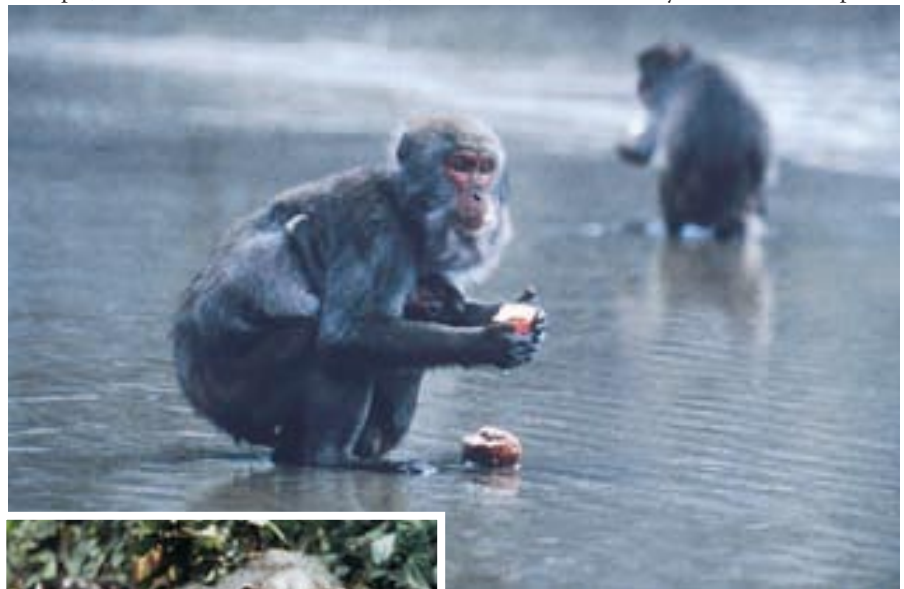
Figure 1 Japanese monkey washing potatoes. About half a century ago, a juvenile Japanese macaque developed sweet-potato washing on the island of Koshima. The habit spread to the rest of the population. None of these monkeys is still alive today, but their descendants are still washing potatoes.

Genes determine general abilities, such as tool use, but it is hard to imagine that they instruct apes how exactly to fish for ants or whether or not to make cushy seats out of vegetation. Moreover, Whiten and colleagues found no evidence that habits vary more between, than within, the three existing subspecies of chimpanzee. So genetics cannot account for the observed variability. Take the two best-known communities: those studied by Jane Goodall in Gombe National Park, and by Toshisada Nishida in the Mahale Mountains, both in Tanzania. The two sites are only 170 km apart, and both are inhabited by the Eastern subspecies