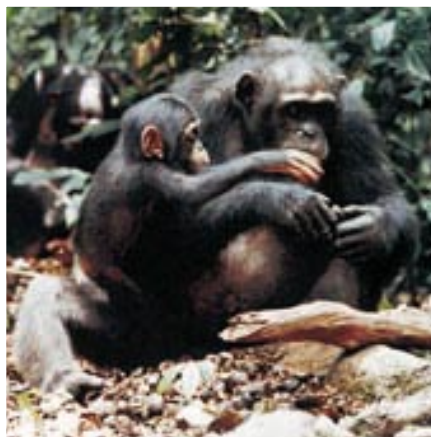
Figure 2 Transmitting culture — this chimpanzee shares the nut that she has just cracked open. Nut-cracking, one of the best-studied cultural variants, is acquired by young chimpanzees only after many years of practice.